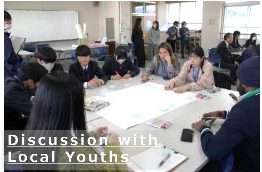
Discussion with Local Youths