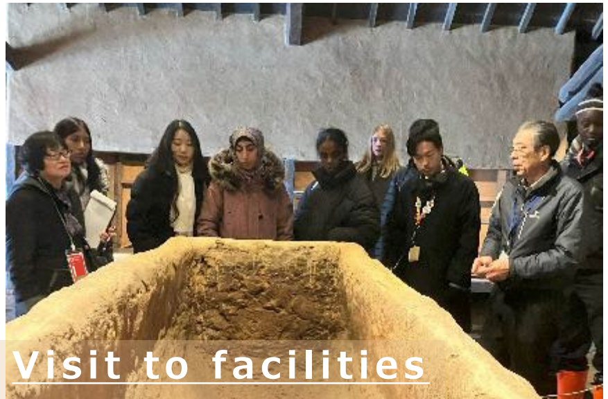
Visit to facilities