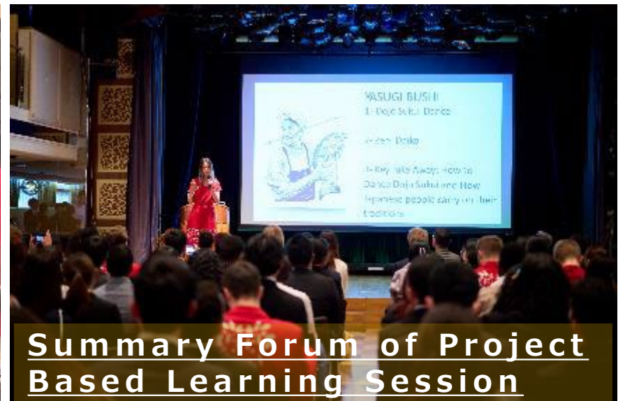
Summary Forum of Project Based Learning Session