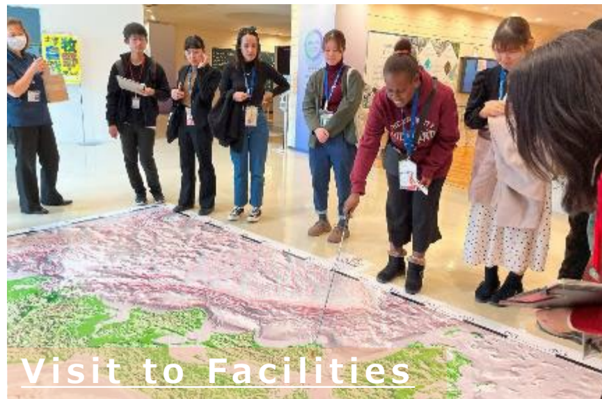
Visit to Facilities