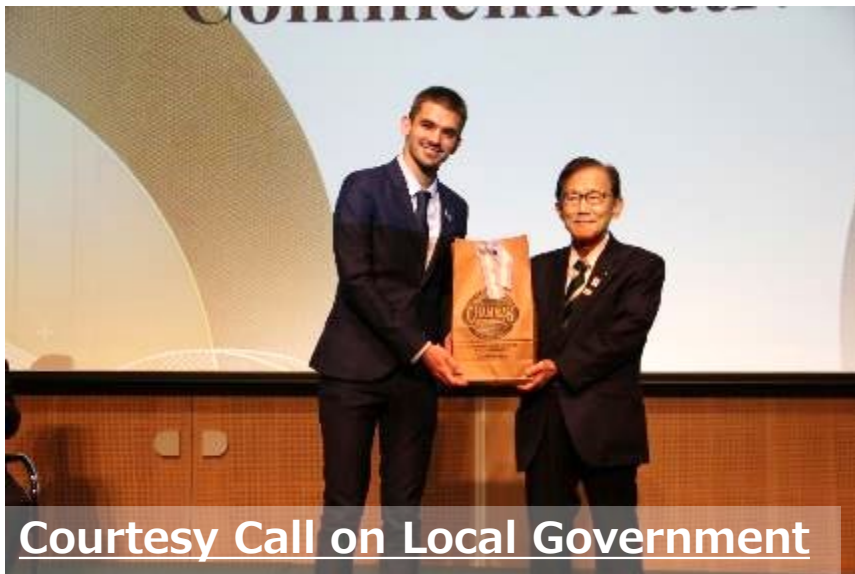
Courtesy Call on Local Government