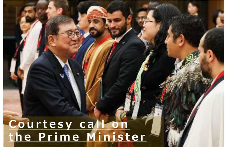
Courtesy call on the Prime Minister